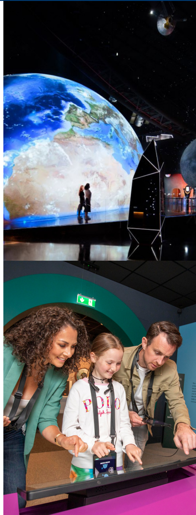
Top: Shanghai Astronomy Museum; Bottom: The Irish Racehorse Experience (at The Irish National Stud)